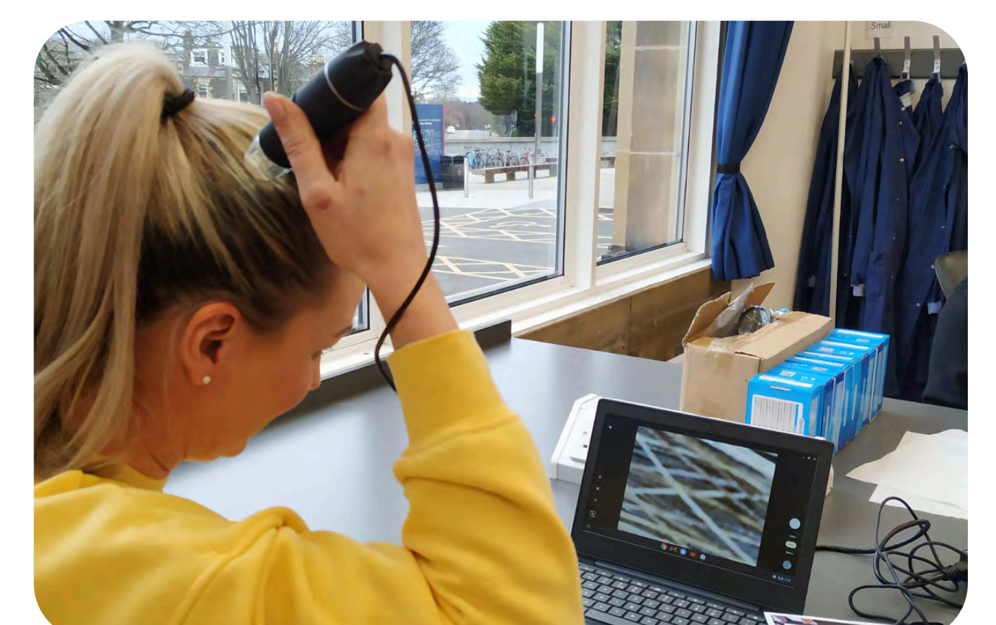
Finding alternative use for the donated microscopes.