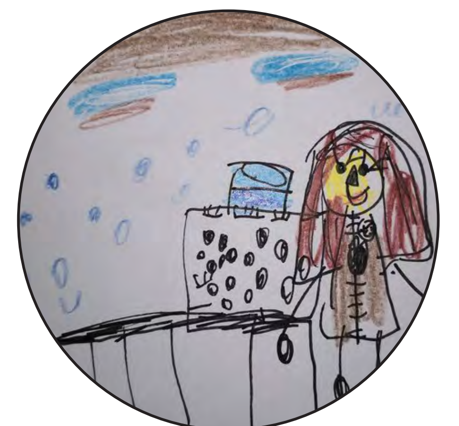
Impression of Sarah with mosquitoes.